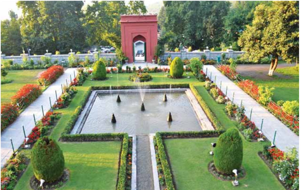
Above: Chashma Shahi; Below: Shops along the lake