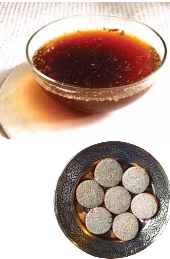
Top: Kashmiri Kahwa; Above: Local cookies; Top right: Kashmiri stole